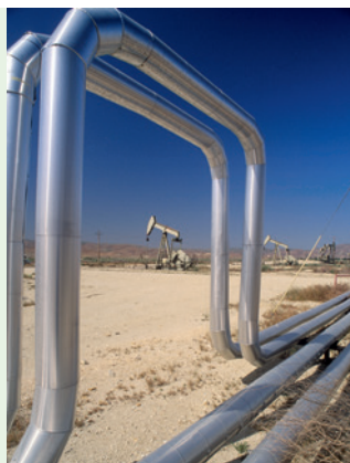
Cover picture: SEM (Scanning Electron Microscopy) image of an unprotected L80 steel coupon after a corrosion test (false color representation)

Corrosion inhibitors can impact the corrosion rate by various means, and organic film-forming inhibitors constitute one of the most important classes of corrosion inhibitors. They are adsorbed at the metal surface creating a diffusion barrier which reduces the corrosion rate. To allow for a cost-effective solution, these additives have to rapidly form a persistent film at low concentrations. Basocorr™ products satisfy these requirements for a large variety of conditions and applications.