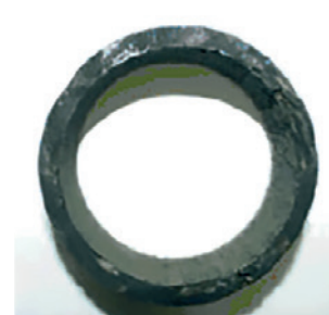
After 3 hours static soak time.