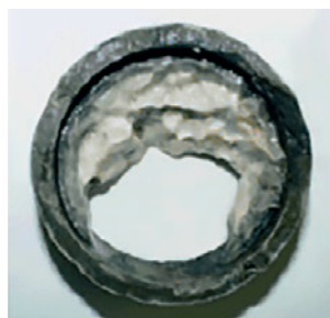
Solutrix™ E has excellent penetrative properties, liberating scale from the pipe wall, accelerating dissolution.