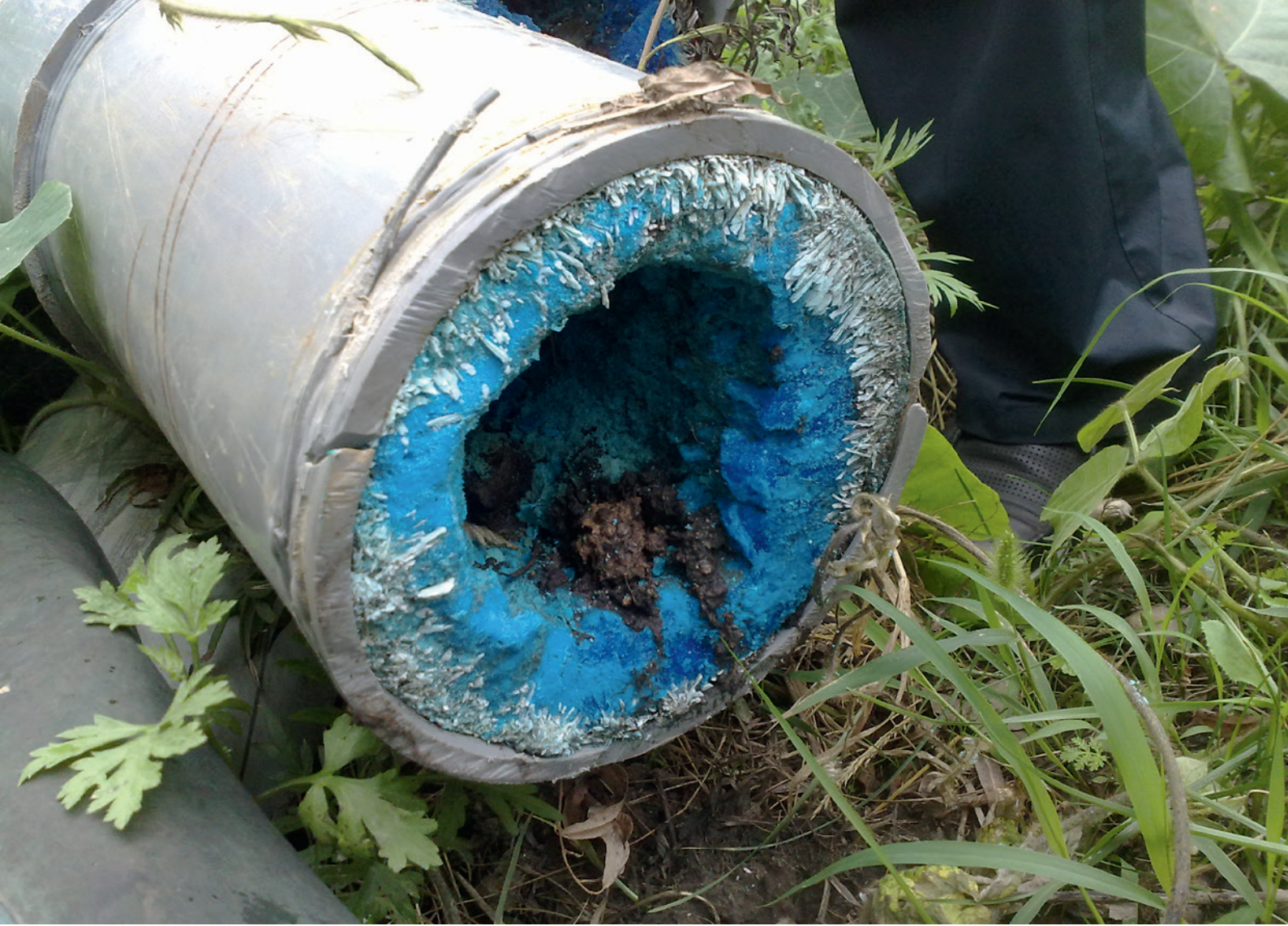
Calcium sulfate scale collected from a pregnant liquor pump.