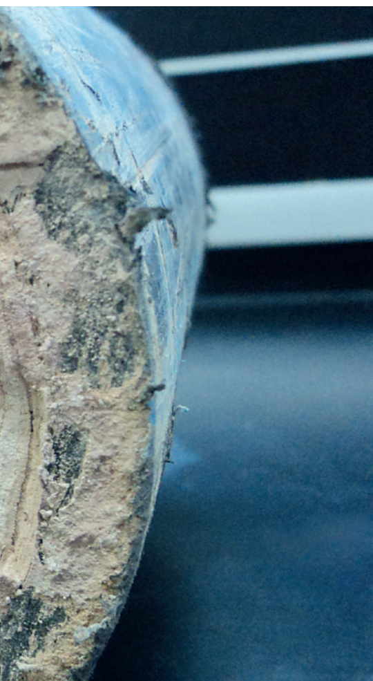
Calcite scale with particulate inclusions in a tailing disposal line.