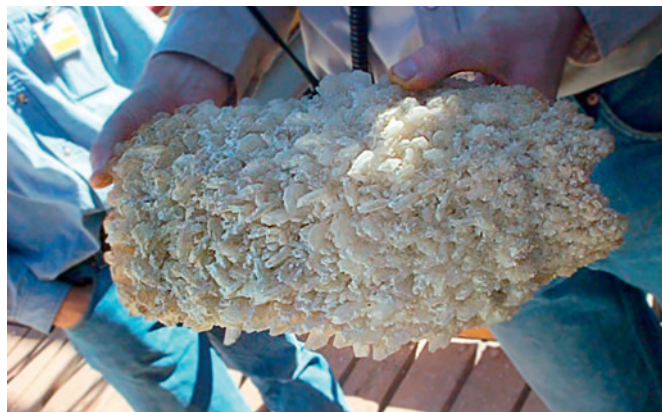
A large gypsum crystal formation resulting from a slow precipitation in a Ni/Co SX plant.

For dissolution of sulfate and phosphate scales, recycling of the spent solution is not recommended due to the impact of ionic strength and common ions on the solubility product.