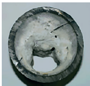
Severe concentric scale has nearly closed the pipe.

Removal of Calcite from a pipe with 5 % Solutrix™ E solution.