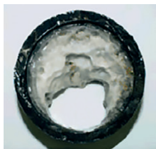
Dissolution of the scale commences upon treatment with Solutrix™ E.